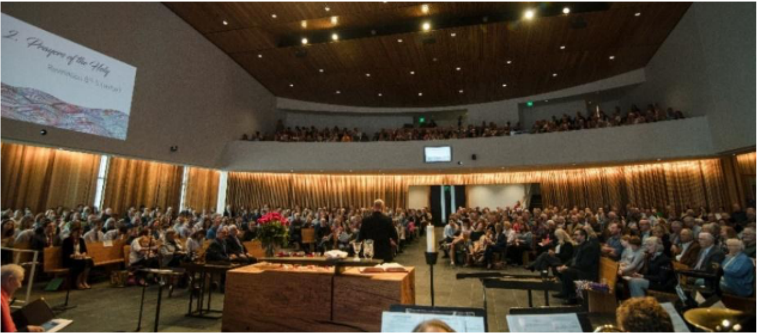
A look back at the opening dedication of the new church, April 2019.

The monthly newsletter of Countryside Community Church