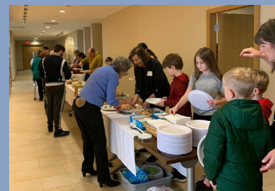
Taste of Tri-Faith on February 23