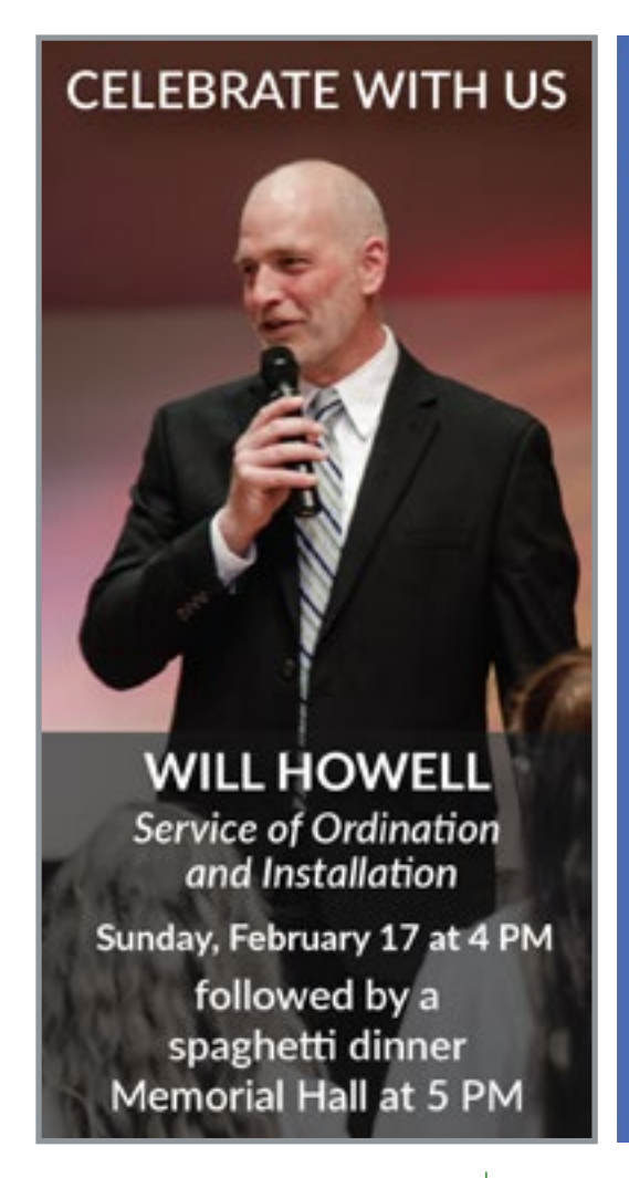
details page 5

NON-PROFIT ORG. U.S. POSTAGE PAID Omaha, Nebraska Permit No. 106