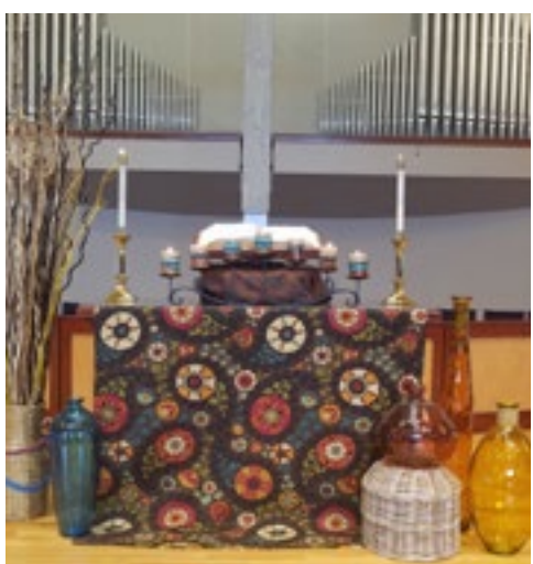
A closer look at the Common Ground wall and the chancel design inspired by the sermon series.