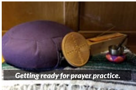
Getting ready for prayer practice.

This spring, our Core 56 students will learn about a variety of prayer practices. While we already practice a seated meditation, we will expand this practice to include some deliberate techniques to focus and engage further with the Spirit. In some exciting news, we have ordered a portable canvas labyrinth that will not only be a point of study for the Core 56 students but will also be available for other members and friends of Countryside. It'll be 30 feet wide and ready for walking meditation as soon as it arrives!