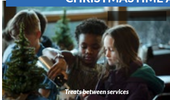
Treats between services