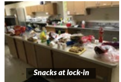
Snacks at lock-in

COYO Jr High is back on Sunday afternoons starting January 6 at 4:30 PM.