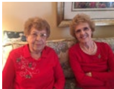
(Top left) Pastoral Care Board serving staff appreciation lunch.