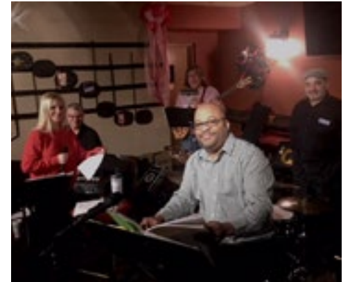
Enjoying Christmas tunes from Countryside Jazz at the annual Jazz Christmas.