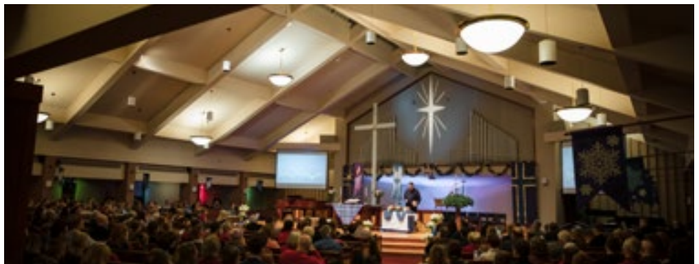
Last Christmas for Countryside at 8787 Pacific Street