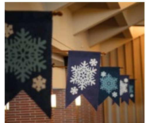
Countryside is decked out in purple for the Christmas season.