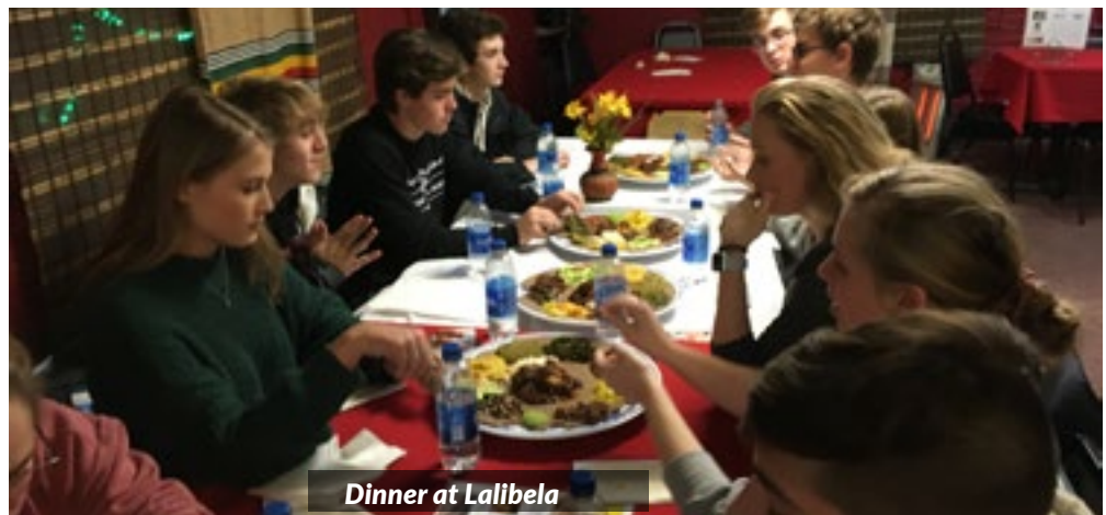
Dinner at Lalibela

We had about three times more toys than we have had before, which is great because Toydriveforpineridge.org wanted to go to two more schools this year but they weren't sure they were going to get enough toys. When they pulled up and saw our collection they were relieved and overjoyed!