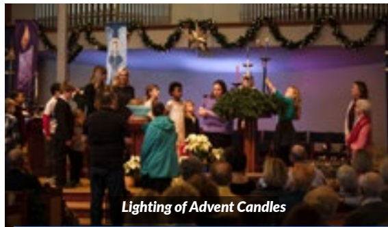
Lighting of Advent Candles