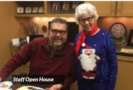
Staff Open House