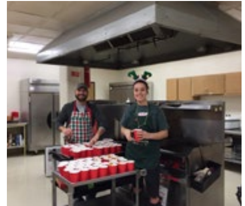
Working on ornaments and serving treats at the Advent workshop.