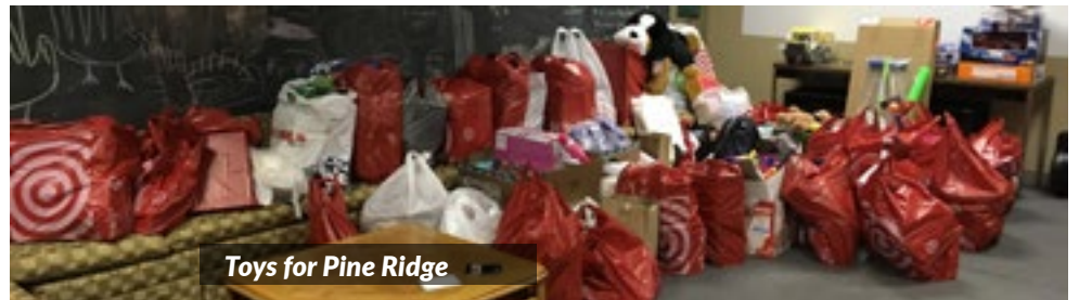
Toys for Pine Ridge

We had about three times more toys than we have had before, which is great because Toydriveforpineridge.org wanted to go to two more schools this year but they weren't sure they were going to get enough toys. When they pulled up and saw our collection they were relieved and overjoyed!