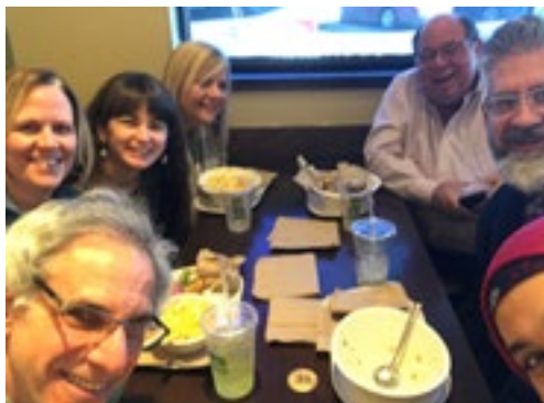
Office staff from Temple Israel, AMI and Countryside meet for lunch.