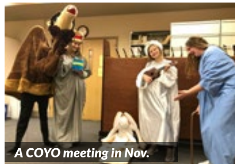
A COYO meeting in Nov.

COYO Jr High is taking a break from Sunday afternoons. Stay tuned for more information.