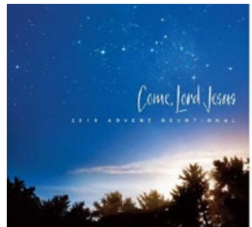
2018 Advent Devotional, "Come Lord Jesus"

Please remember to submit your final contributions of 2018 to the church before the end of the year. The IRS looks closely at charitable giving, and we want you to understand that in order for your contribution to be deductible in 2018, your contribution must be postmarked or physically received at the church office by December 31, 2018. Please note that your check date alone will not control which year your contribution applies to.