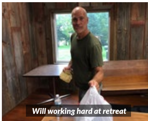
Will working hard at retreat