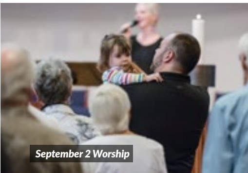
September 2 Worship