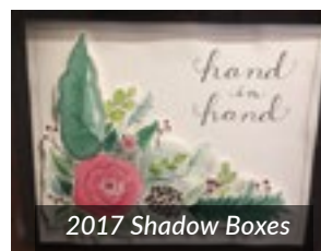
2017 Shadow Boxes