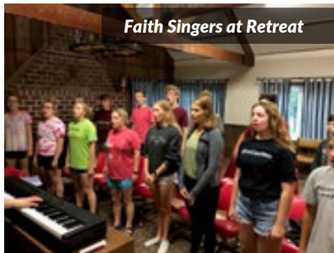
Faith Singers at Retreat

It's not too late to join COYO Jr High on Sunday evenings and for events, service projects, and faith formation. 4:30 COYO Jr High, 6:00 Dinner for all students.