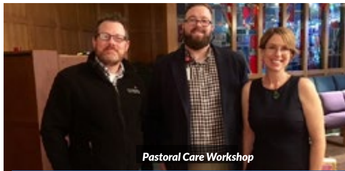
Pastoral Care Workshop