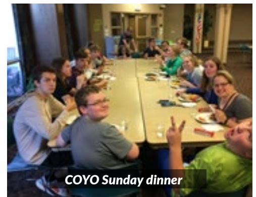
COYO Sunday dinner