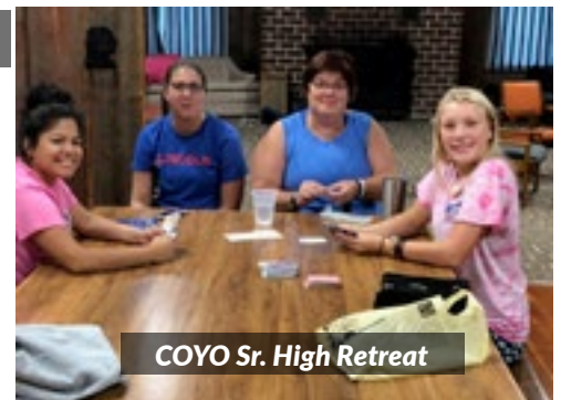
COYO Sr. High Retreat