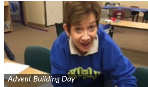
Advent Building Day