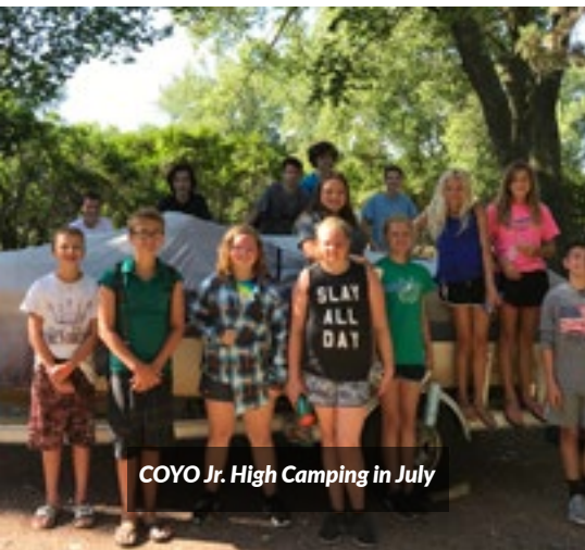
COYO Jr. High Camping in July