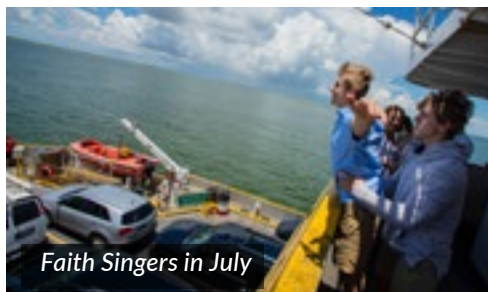
Faith Singers in July