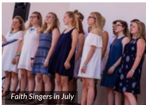
Faith Singers in July