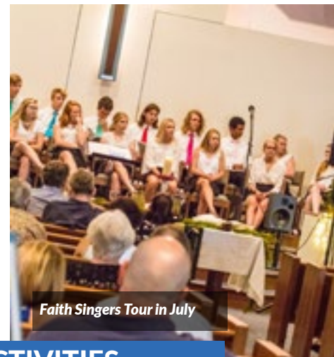
Faith Singers Tour in July