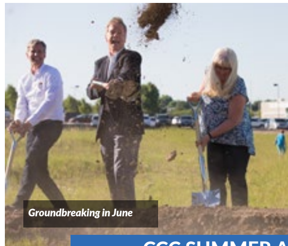
Groundbreaking in June