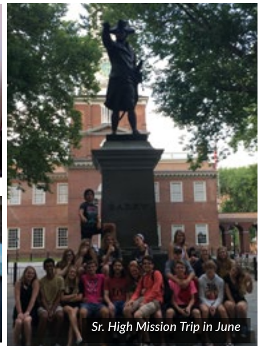
Sr. High Mission Trip in June